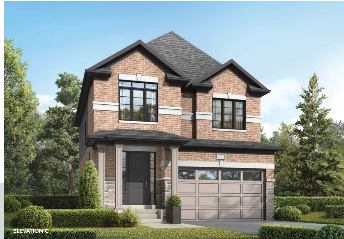
ELEV A: 1,843 SQ. FT. / ELEV B: 1,821 SQ. FT. / ELEV C: 1,829 SQ. FT.