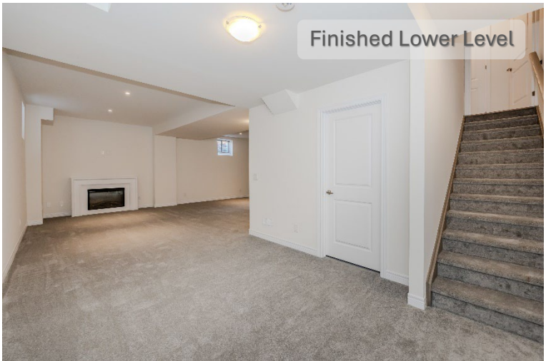
Finished Lower Level