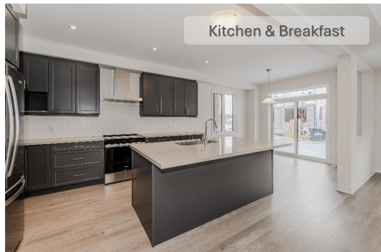
Kitchen & Breakfast