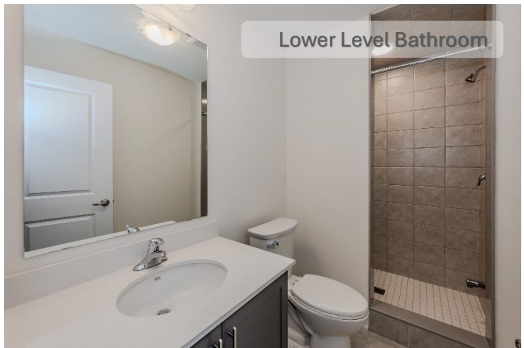
Lower Level Bathroom