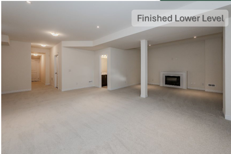
Finished Lower Level