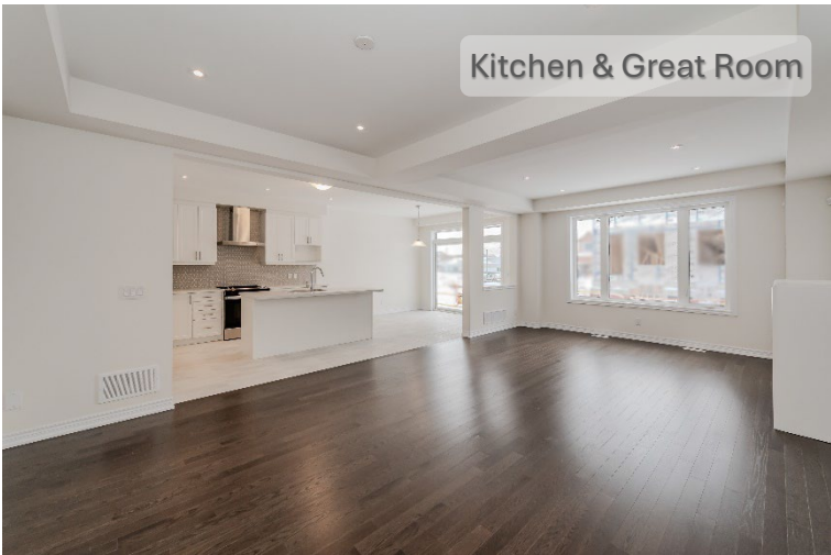
Kitchen & Great Room

◆Includes Lower Level Bathroom. * Except where beams and heating equipment are required. **As per plan. Prices and specifications are subject to change without notice. E. & O.E. April 2025