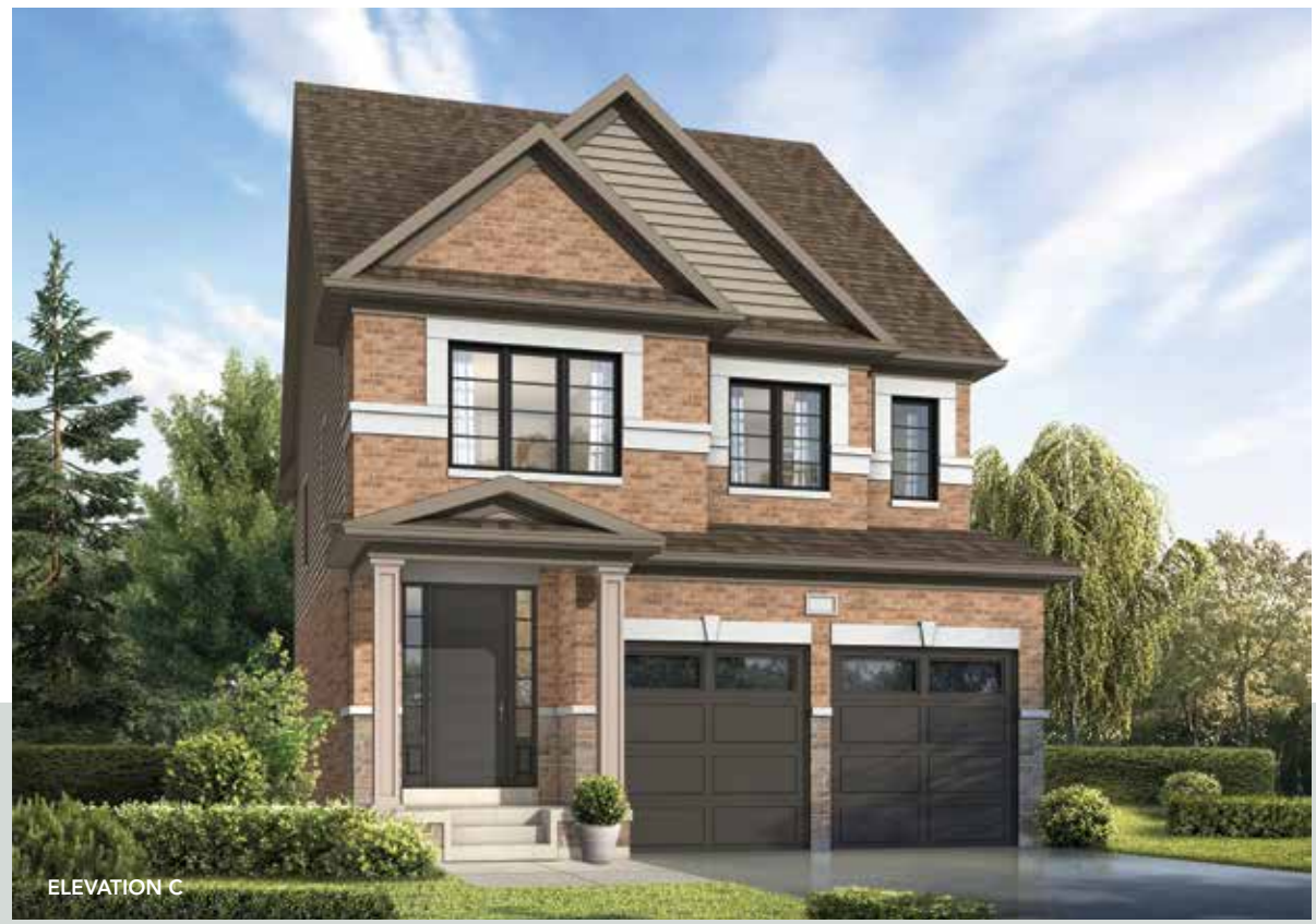
ELEV A & B: 2,775 SQ. FT. / ELEV C: 2,769 SQ. FT. INCLUDING 580 SQ. FT. OF FINISHED LOWER LEVEL