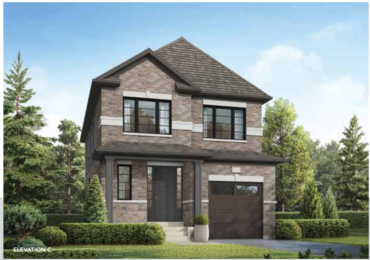
ELEV A & C: 2,483 SQ. FT. / ELEV B: 2,470 SQ. FT. INCLUDING 547 SQ. FT. OF FINISHED LOWER LEVEL