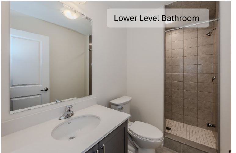
Lower Level Bathroom