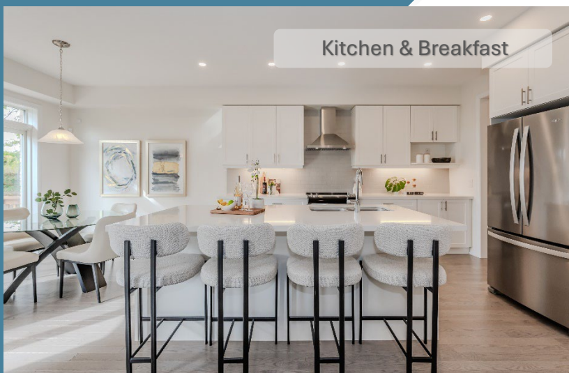
Kitchen & Breakfast