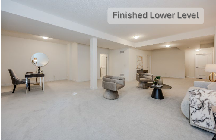
Finished Lower Level