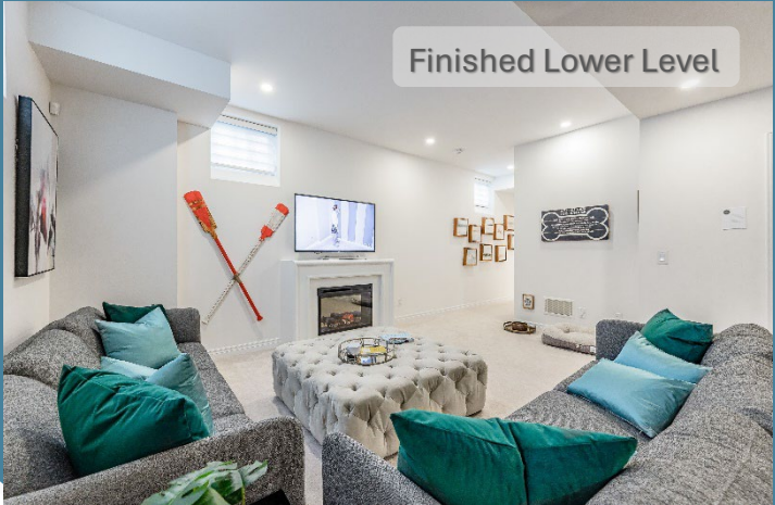
Finished Lower Level