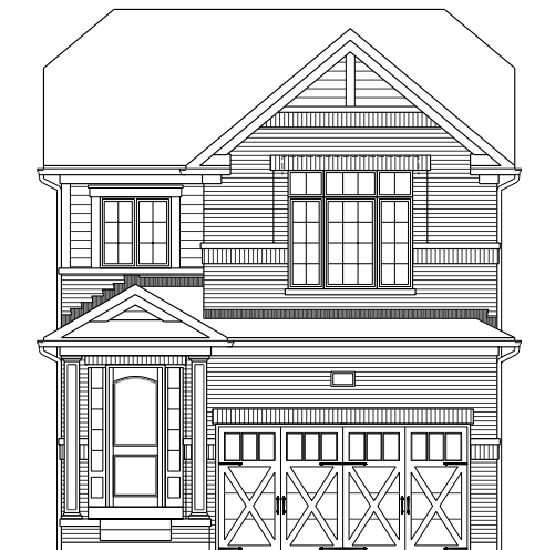
FRONT ELEVATION A ACTUAL GRADING CONDITION MAY VARY

Plans and specifications are approximate and are subject to change without notice. Actual usable floor space may vary from the stated floor area. E. & O. E. June 2022. Model 25-2362