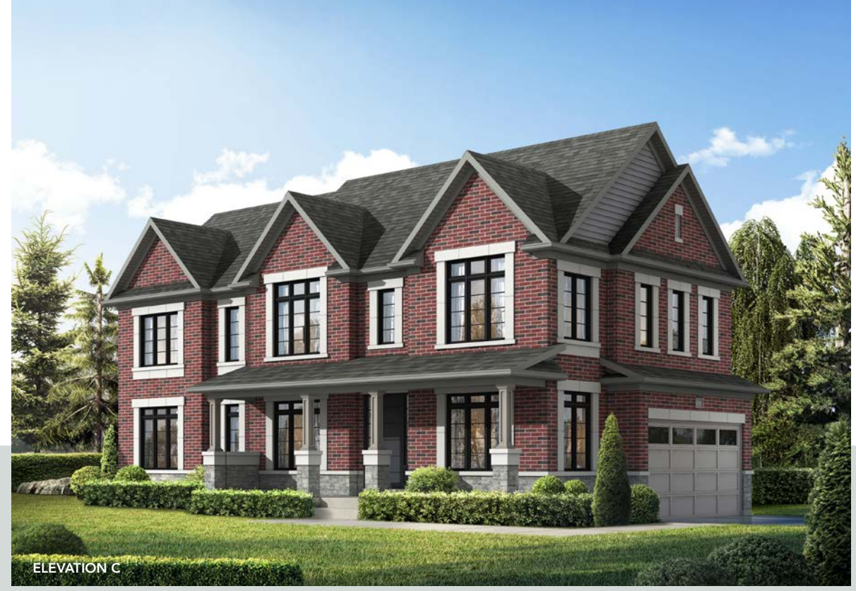
ELEV A: 3,321 SQ. FT. / ELEV B: 3325 SQ. FT. / ELEV C: 3,332 SQ. FT. INCLUDING 778 SQ. FT. OF FINISHED LOWER LEVEL